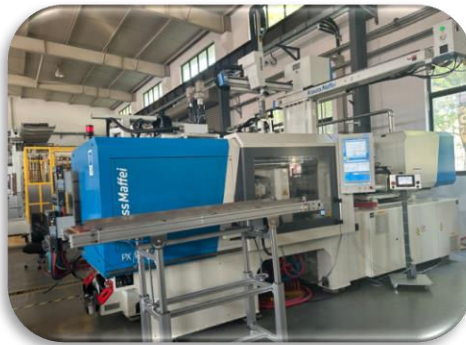
Roctool technology installed at ENRX Shanghai premises in China

As planned in their strategic agreement, Roctool and ENRX have completed the installation of the new demonstration center in China, with the aim of promoting the technology directly within the ENRX factory in Shanghai. The demonstration center in the United States, at the ENRX factory in Detroit, is in the installation phase and will also be operational in the coming weeks. These two centers will be able to help accelerate the number of projects during the second half of 2024.