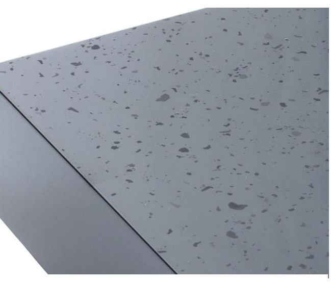
Part molded by Roctool during the K-show 2022 in Dusseldorf, Germany

Roctool heat and cool technologies have now been integrated into two of Standex Engraving Mold-Tech facilities to support customer projects globally, with more expansions to come.